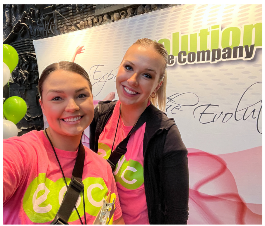
Check in with EDC Staff