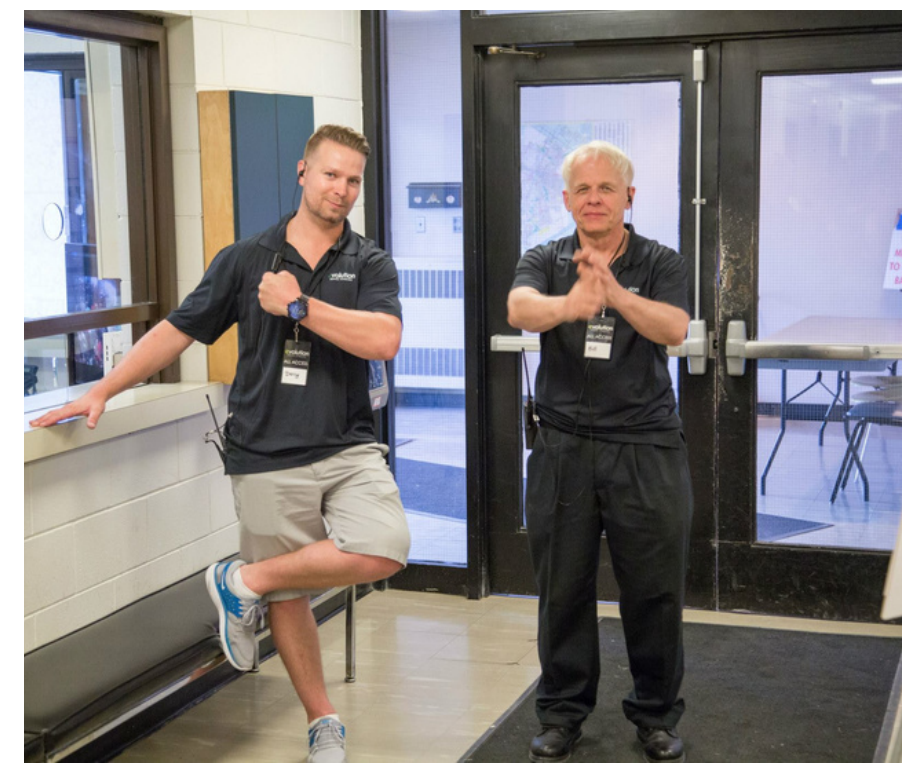
Enter through Lily St doors