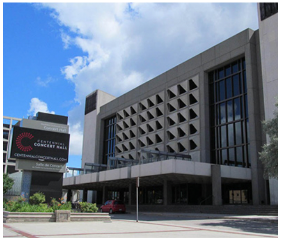
Centennial Concert Hall

Please have dancers arrive with hair and makeup complete and jewelry on. We ask that all dancers arrive in their first costume. A message will be sent out to let you know the team's performance order closer to recital.