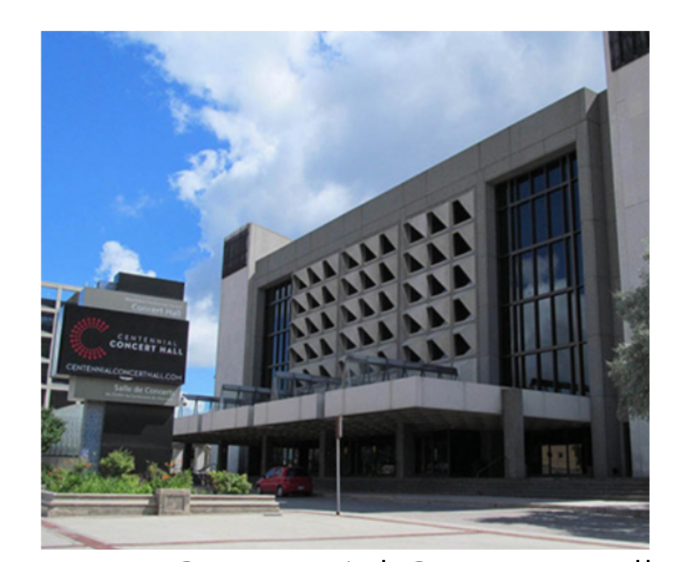
Centennial Concert Hall

Please have dancers arrive with hair and makeup complete and jewelry on. We ask that all dancers arrive in their first costume. A message will be sent out to let you know the team's performance order closer to recital.