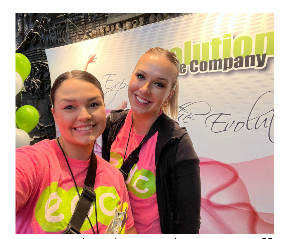
Check in with EDC Staff