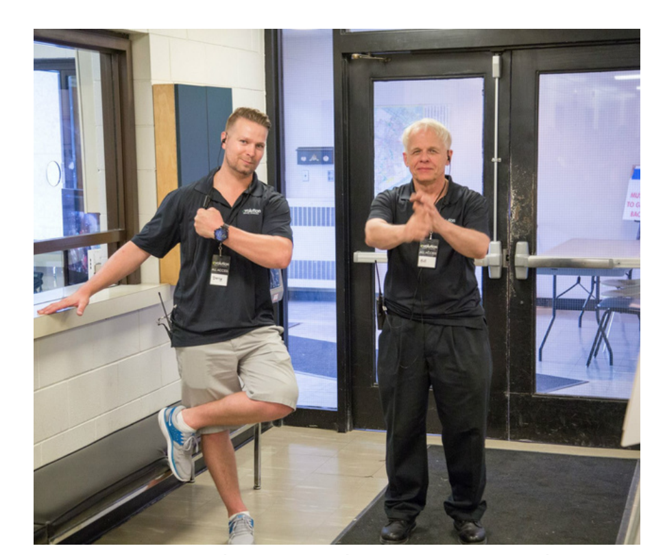
Enter throught Lily St doors