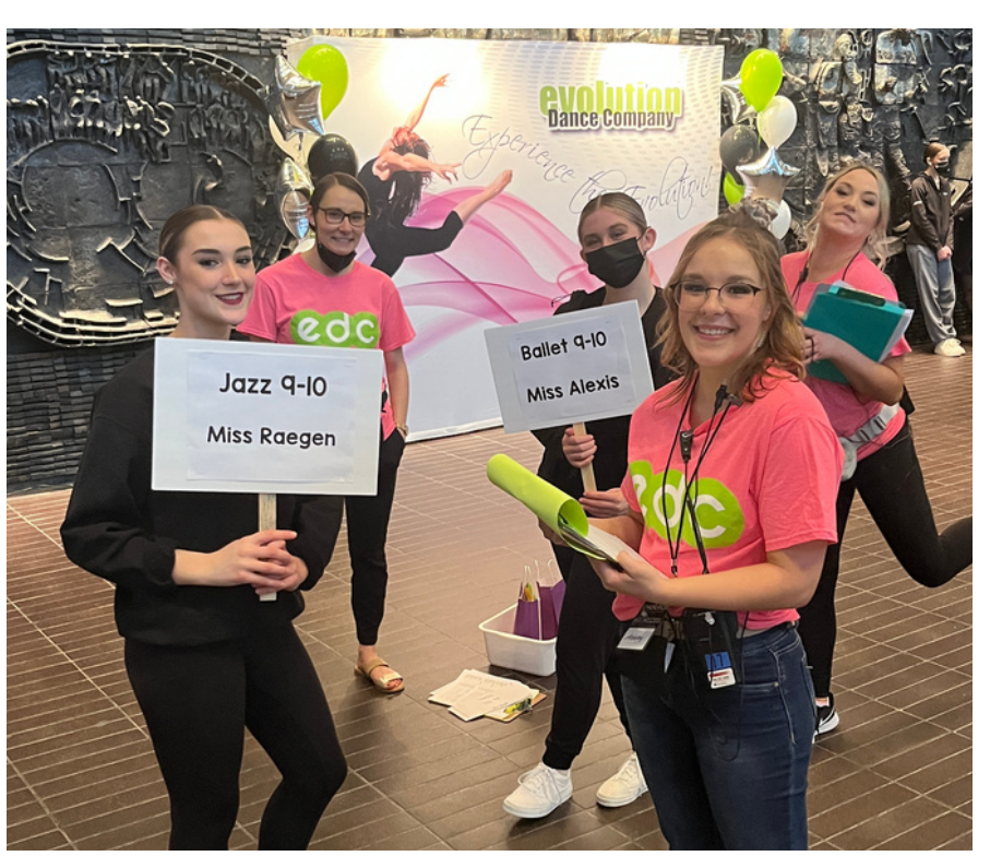
Find EDC Staff with your class sign