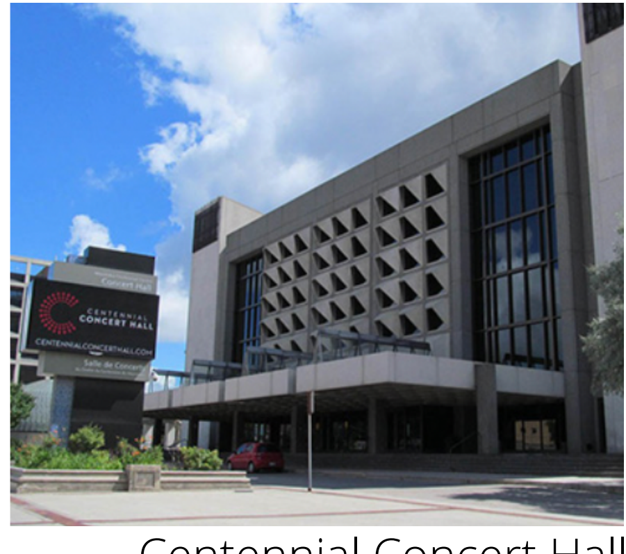
Centennial Concert Hall

Parents are asked to go down to the basement level waiting area of the Concert Hall, as the vestibule must stay clear for the next group of dancers getting dropped off.