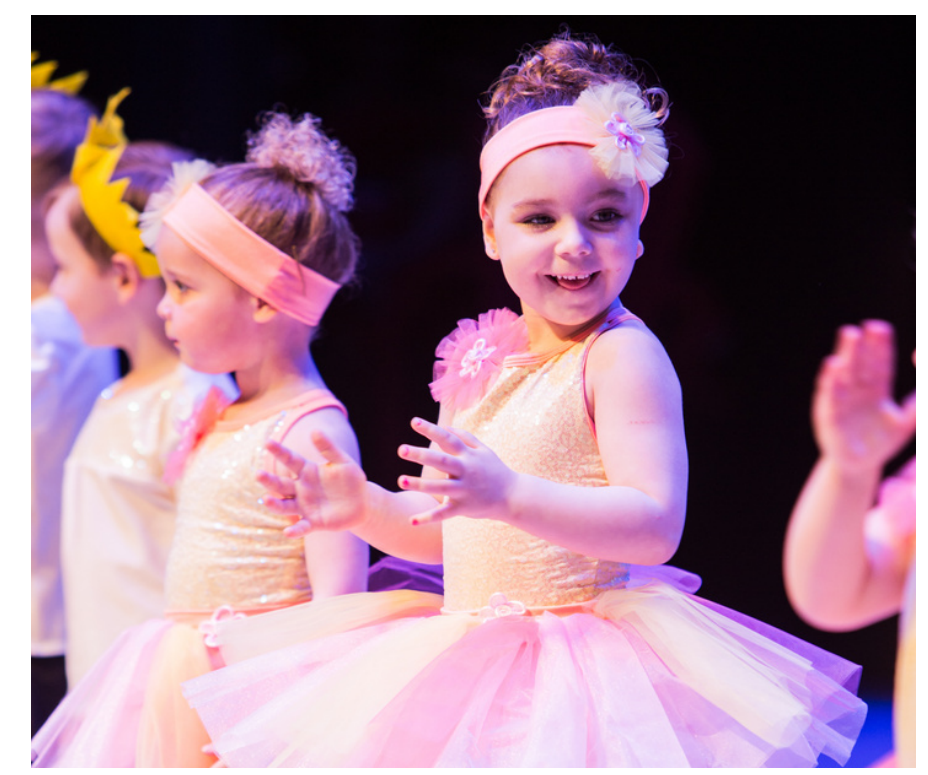
Arrive in your costume!